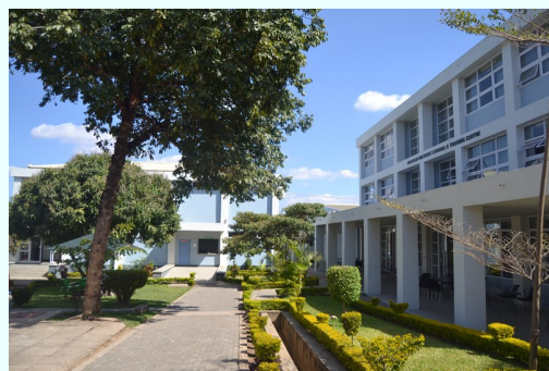
Malawi-Liverpool-Wellcome Trust Clinical Research Programme

The Malawi-Liverpool-Wellcome Trust Clinical Research Programme (MLW), in partnership with the University of Malawi College of Medicine (COM), the Malawi Ministry of Health and Queen Elizabeth Central Hospital (QECH) conducts internationally competitive, cutting-edge, fundamental clinical and epidemiological research that addresses the health challenges facing populations of sub-Saharan Africa and beyond. The Wellcome Trust Research Laboratories are situated on the grounds of QECH, close to the CoM main campus. Queen Elizabeth Central Hospital (QECH) is one of Malawi's four national referral hospitals, is the main teaching base for the CoM, and functions as the district general hospital for a local population of ~1 million. This institutional partnership will host the AMBITION trial in Blantyre.