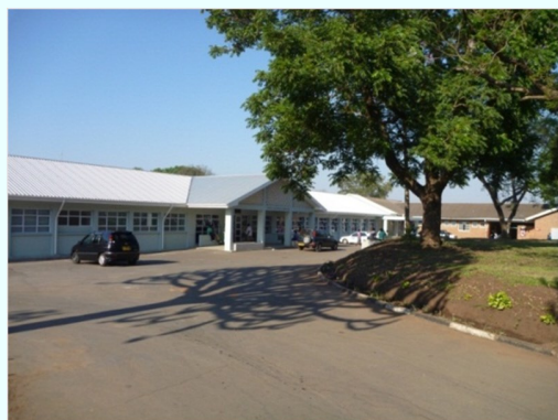
Queen Elizabeth Central Hospital (Malawi Ministry of Health)