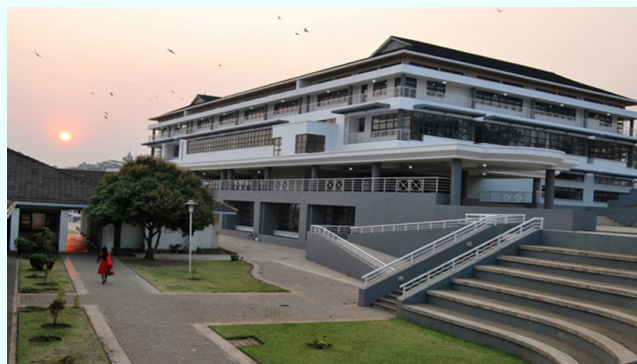
University of Malawi College of Medicine (COM)