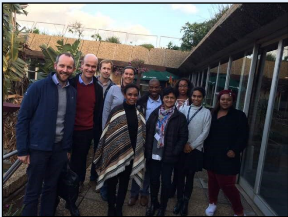
Smiles all round for the Cape Town SIV team!

All in all, the SIV was a great success! Well done to everyone involved—we look forward to recruiting many more patients in the coming weeks and months.