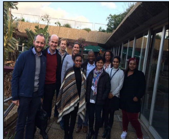
Site Initiation Visit in Cape Town, 26 June-6 July