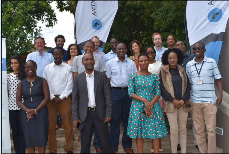
First African Meningitis Trials Network (AMTNET) meeting in Lilongwe, 30–31 January