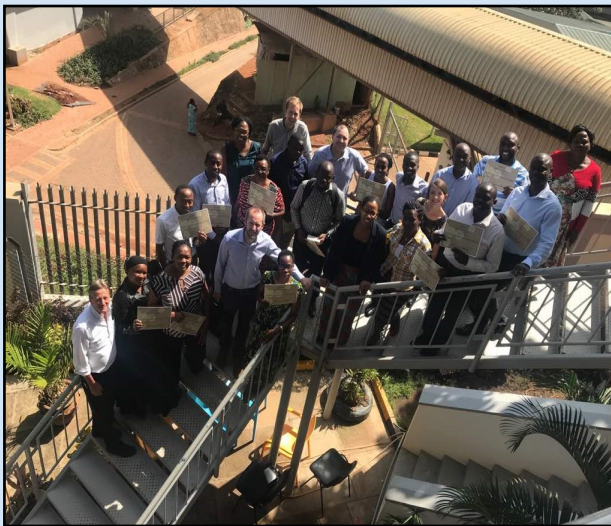
Site Initiation Visit in Kampala, 5-9 August