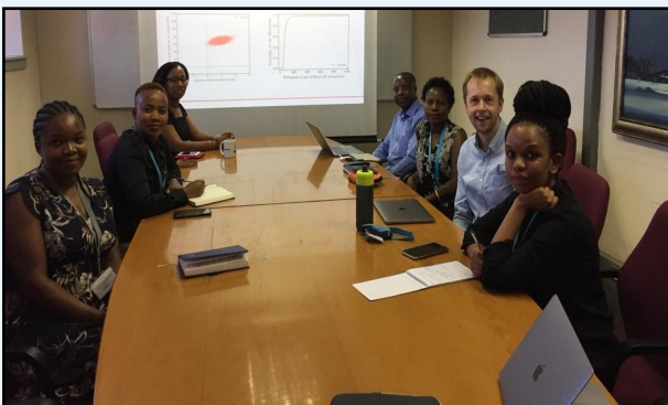
Leading discussions about cost-effectiveness analysis in Gaborone...