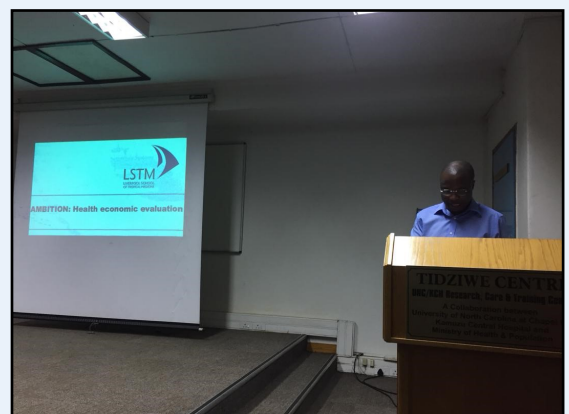
...and conducting a teaching session on 'Health Economics Evaluation' in Lilongwe to a group of 40 from UNC Project.