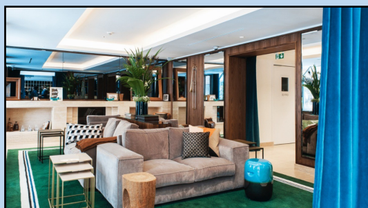
Hotel Eiffel Blomet