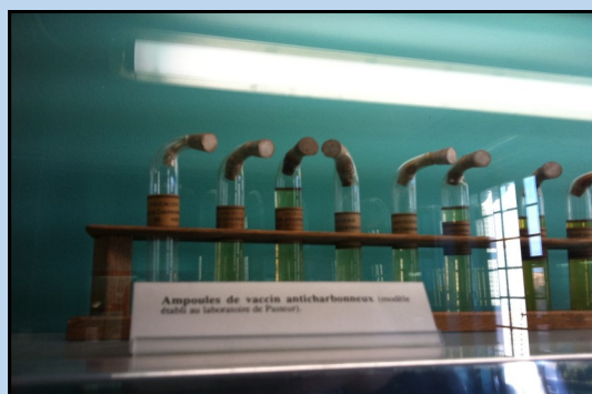
Institut Pasteur Museum