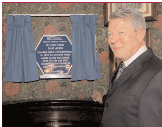
Alan Johnson, Secretary of State for Health, unveils the new plaque