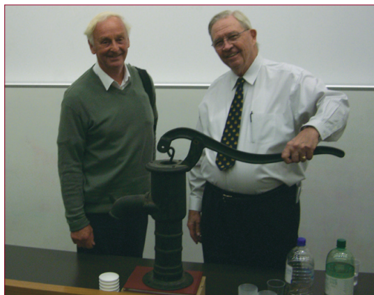
The ceremonial handle is removed by PHL#16 (DA), watched by PHL#1(NW)

It was a lecture to be long-remembered, by all who were present. The slides, and a recording of the entire 16th annual Pumphandle lecture, can be accessed on the Society's website.