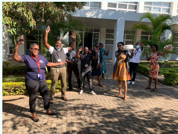
Celebrating the 100th participant in Blantyre (May 2020)