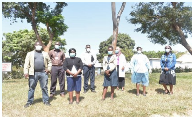
UNC Project Malawi AMBITION team (May 2020)