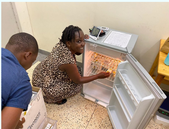
Organising drugs in Mbarara (January 2020)