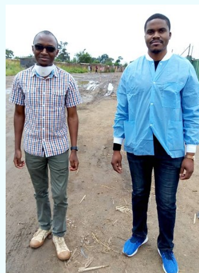
Conducting follow-up visits during lockdown in Harare (April 2020)