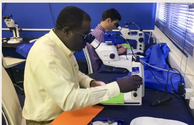
Surgeons practise techniques again and again. SOUTH AFRICA

Although it takes years of experience and practice in the operating theatre to become an expert cataract surgeon, learning cataract surgery to an acceptable level of competence can be achieved safely and efficiently thanks to cataract training by simulation.