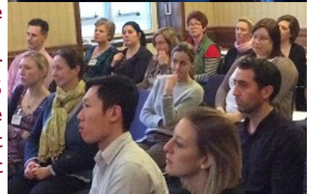
Delegates at the PREVENTT Investigator Meeting